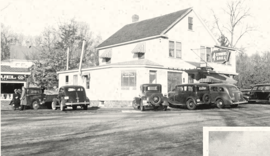
Four Corners Grill was a Depression-era favorite.

Maples is proud to call Middlebury home! Whether you're a fellow resident or a visitor, we hope you enjoy the beauty that is and was Our Home Town!